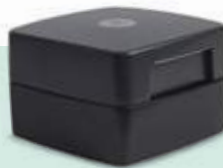
TBS10 Test box