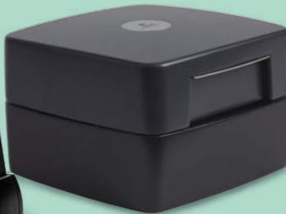
TBS10 test box for Hearing Instrument Testing