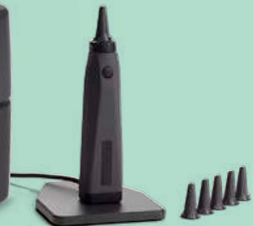
Viot™ video otoscope offers full integration in the Callisto™ Suite