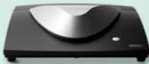
Affinity 2.0 The integrated fitting solution