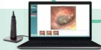
Viot™ Video otoscope