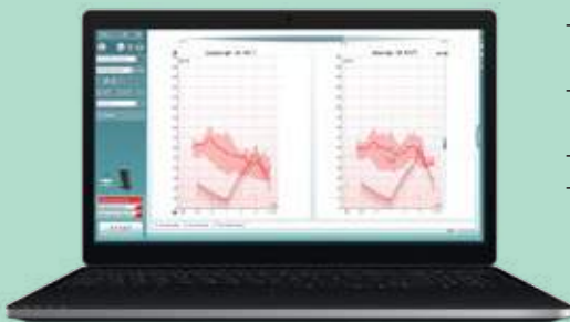
Visible Speech Mapping (optional)